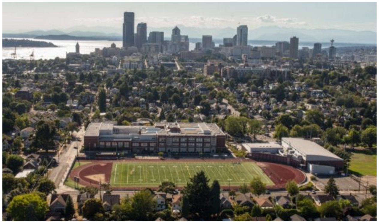
Seattle's Garfield High School

In Seattle, where I live and where my granddaughters attend public schools, approximately one-third of the city's white students attend elite private schools while one-third of the city's students of color attend a high-poverty school. As well, almost half of all African American and Latino students in the city do not graduate in four years, if at all. Very distressing, these dismal numbers have held constant for decades, according to several friends who have been longtime residents.